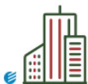
Building Energy Management